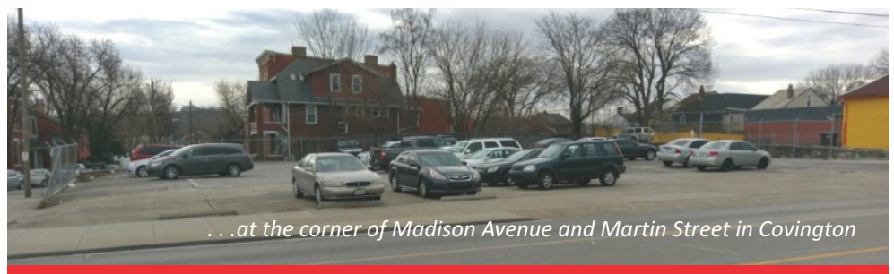
...at the corner of Madison Avenue and Martin Street in Covington