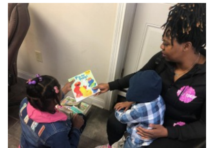
Three satisfied customers!